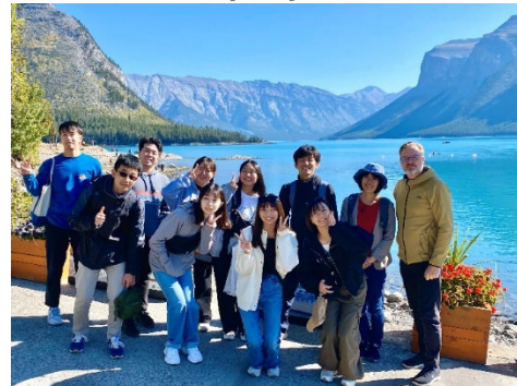
Canadian Rocky Mountains